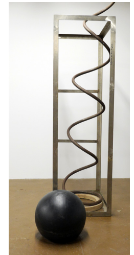
Spirale 2007 Steel, Granite and Plastic 115" x 24" x 30"