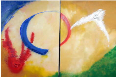
Meditate 2011 Acrylic Paint on Canvas 96" x 132" x 2"