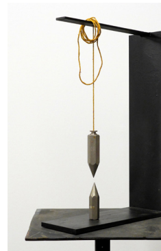
Meeting Elements (Maquette) 1980-2000 Steel and String 16.5" x 10.5" x 4"