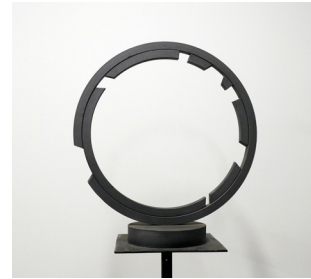
Formation of a Circle I 1997 Steel 24" x 22" x 10"