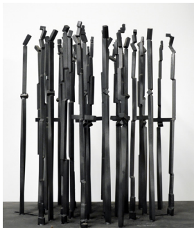
Ombre della serra (Maquette) 1997 Steel 32" x 40" x 24"