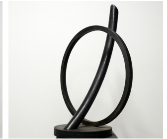
Incanto 1998 Steel 30" x 28" x 16"