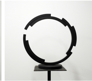
Formation of a Circle II 1997 Steel 24" x 22" x 10"