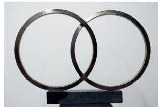
Due cerchi 1998 Steel and Marble 23" x 33" x 4"