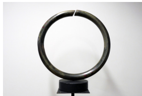
Sequence of a Circle II , 1998, steel, 36 x 31 x 13 in.