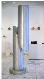
Sliced Column , aluminum, 100 x 24 x 24 in.