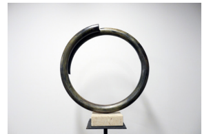
Sequence of a Circle III , 1998, steel and marble, 35 x 31 x 8.5 in.