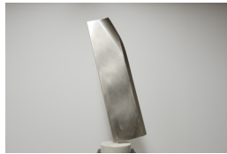
Wind I , 1978–2014, stainless steel and marble, 43 x 14.5 x 9.5 in.