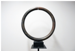
Sequence of a Circle I , 1998, steel, 36 x 30 x 7 in.