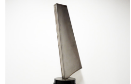
Wind II , 1978–2014, stainless steel and granite, 42 x 24.5 x 11.5 in.