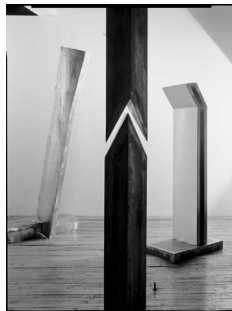
Meeting Elements , 1980–2014, stainless steel, 100 x 12 x 12 in.