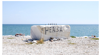
Pensa , 2016, high definition video without sound, 15min., two-channel continuous video projection on lobby walls. Filmed in the quarries of the province of Massa-Carrara, Italy by Marco G. Ferrari.

An extension of this exhibit can be seen at 737 NORTH MICHIGAN