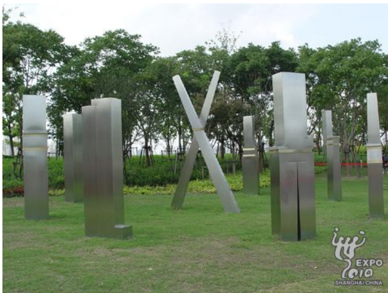
Expo-inspired sculpture "The Family"