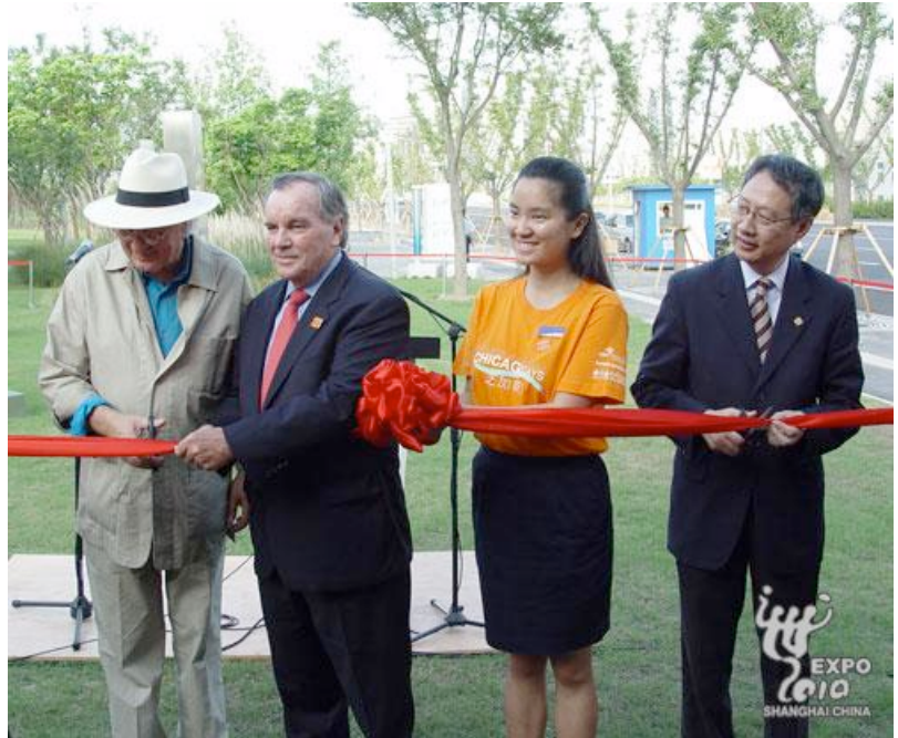
Chicago Mayor Richard Daley and other guests unveil the sculpture "The Family."